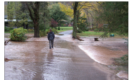
Brown Rd. in Shandaken

Hollow that was destroyed in the flood and to help with stream work in the Esopus Creek in the Town of Shandaken to better protect residents of Brown Road, an area that has repeatedly suffered flood damage.