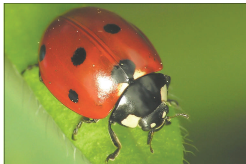
Ladybugs are friendly predators which will help control pests such as aphids.

CCE along with NYS Integrated Pest Management and the NYS Flower Industry, Inc. will be offering an informative bio-control workshop where participants will learn how "good bugs" can be used to control "bad bugs", application techniques, and how to make sure these insects are working to their advantage. Bio-controls for thrips, fungus gnats, aphids, and whitefly will help growers to begin using bio-control methods in their own greenhouse. The workshop will take place on Friday, October, 23 from 9:30am