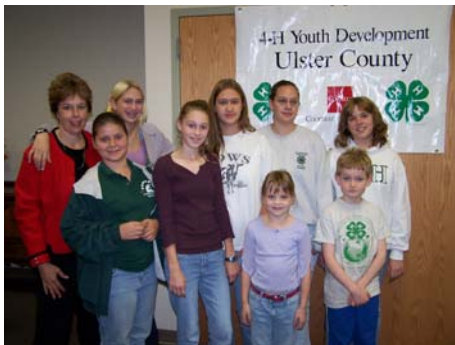
Above & Beyond Award Winners