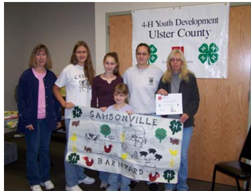
Samsonville Barnyard 4-H Club