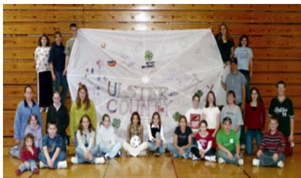
Ulster County 4-H Parachute