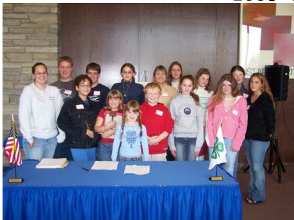
New Officers in Ulster County