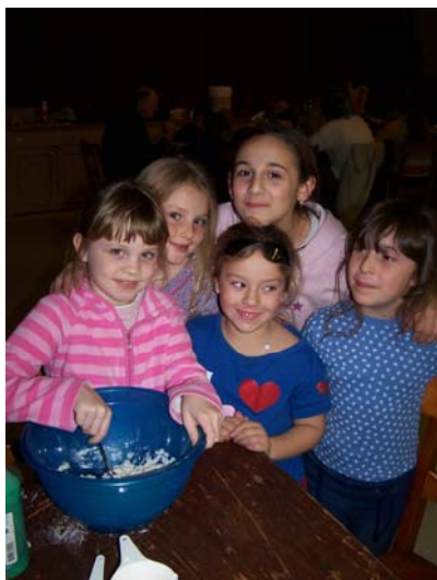
Yummy Christmas Cookies!