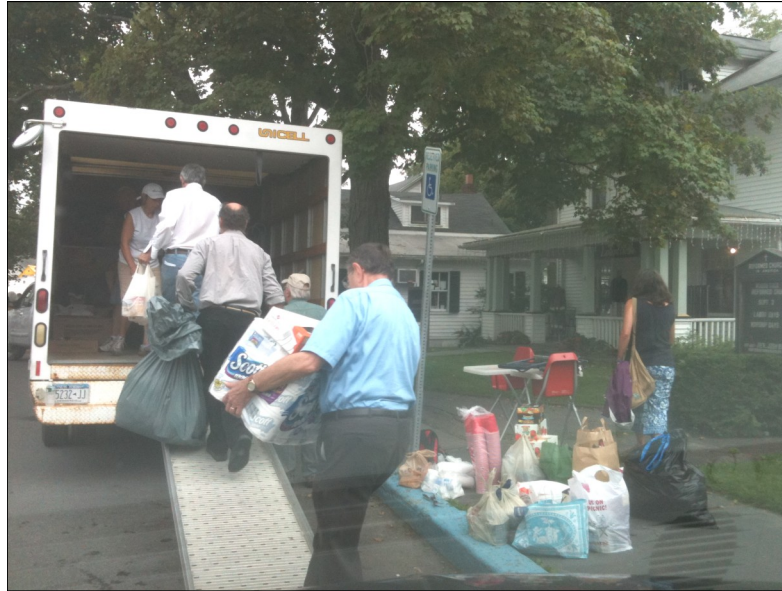
Volunteers loading donations that were gathered by Ulster County 4-H members

The impact of Tropical Storm Irene and Hurricane Lee on the region was devastating as roads, homes and farms were either destroyed or severely damaged. The emotional toll was heavy too as Ulster County residents were left without running water and food, and in many cases, had lost all of their belongings. To help those impacted by the storms, Ulster County 4-H coordinated a food and clothing drive.