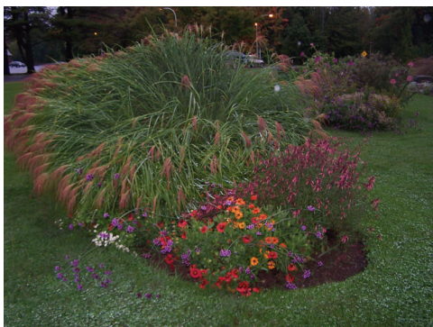
A section of the Xeriscape at SUNY Ulster

The Xeriscape Garden is an interactive teaching tool in the selection of heat tolerant, water-wise plants, integrated pest management and alternative landscaping techniques. Master Gardeners will explain the principles and eco-benefits of this drought resistant garden design and planting techniques which help to create this incredible gardening spectacle.